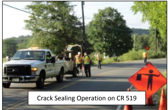
Crack Sealing Operation on CR 519