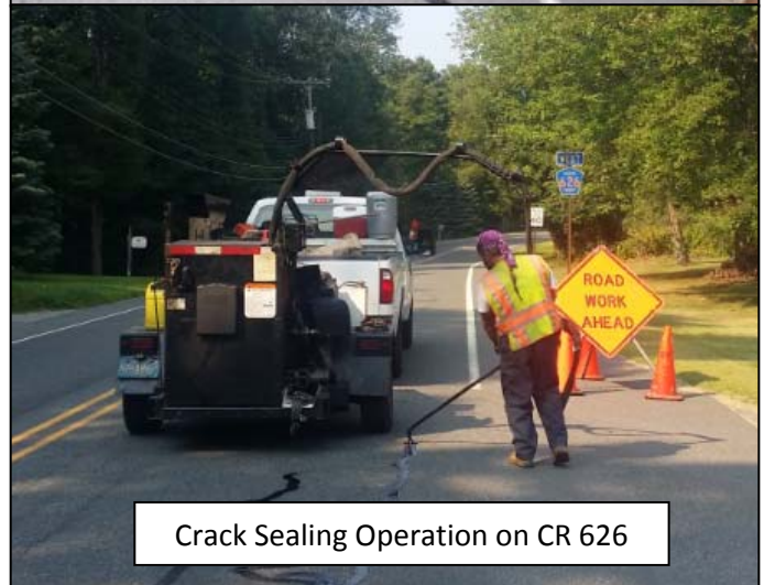
Crack Sealing Operation on CR 626