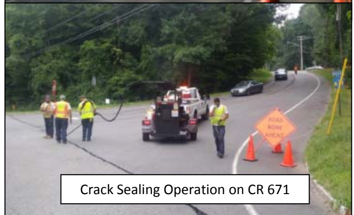
Crack Sealing Operation on CR 671