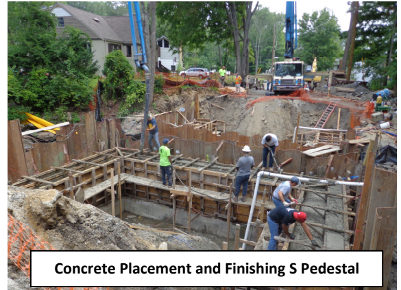
Concrete Placement and Finishing S Pedestal