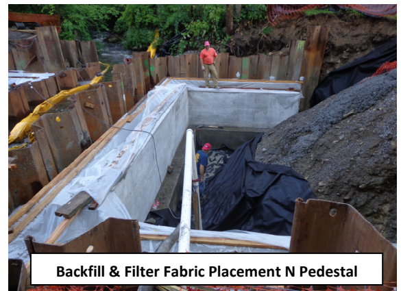
Backfill & Filter Fabric Placement N Pedestal