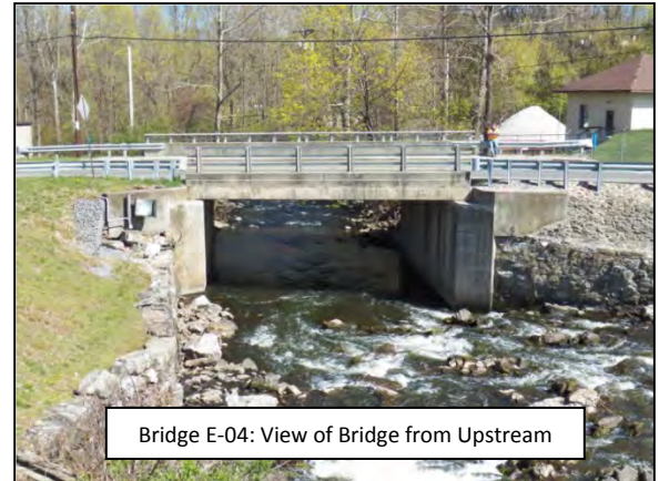
Bridge E-04: View of Bridge from Upstream