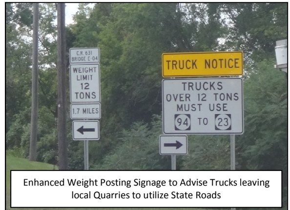
Enhanced Weight Posting Signage to Advise Trucks leaving local Quarries to utilize State Roads