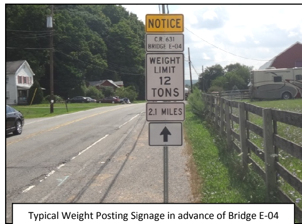
Typical Weight Posting Signage in advance of Bridge E-04