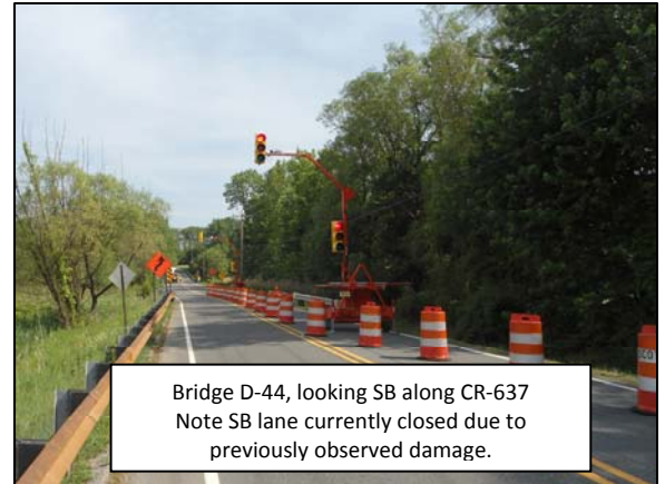
Bridge D-44, looking SB along CR-637 Note SB lane currently closed due to previously observed damage.

For more information about this project please feel free to contact Matt Sinke, Principal Engineer, of the Sussex County Division of Engineering at 973-579-0430 or dpw@sussex.nj.us .