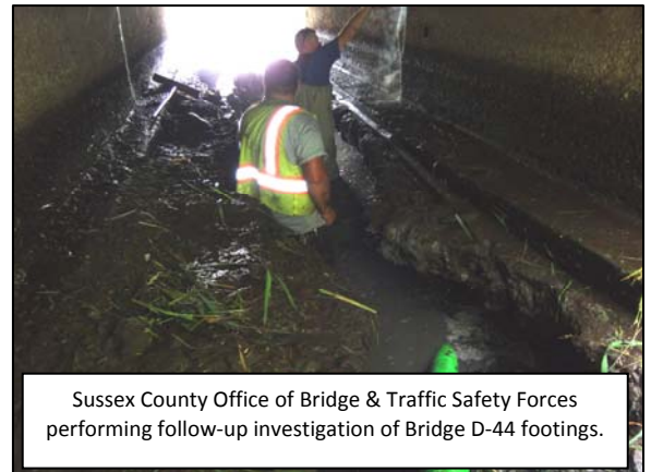
Sussex County Office of Bridge & Traffic Safety Forces performing follow-up investigation of Bridge D-44 footings.