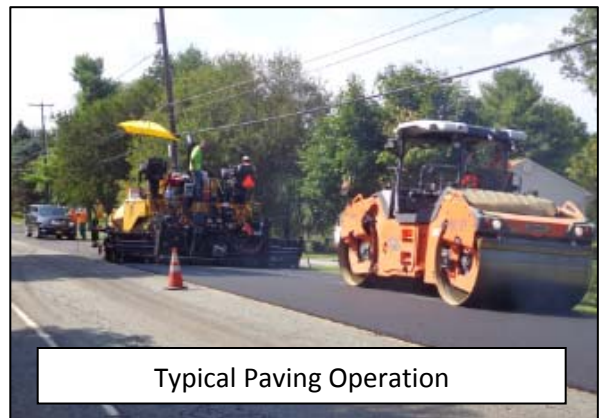
Typical Paving Operation