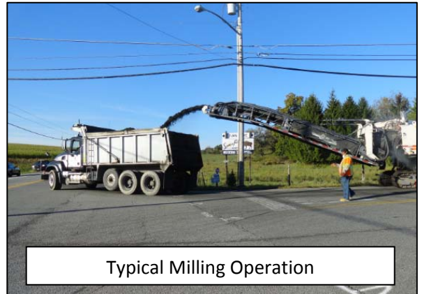
Typical Milling Operation

2. Tentative schedule based on expected progression of the contractor. Subject to change based on weather or other unforeseen circumstances.