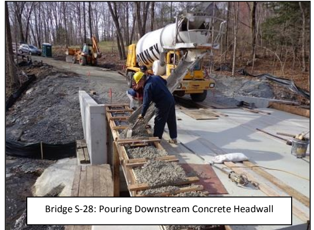
Bridge S-28: Pouring Downstream Concrete Headwall