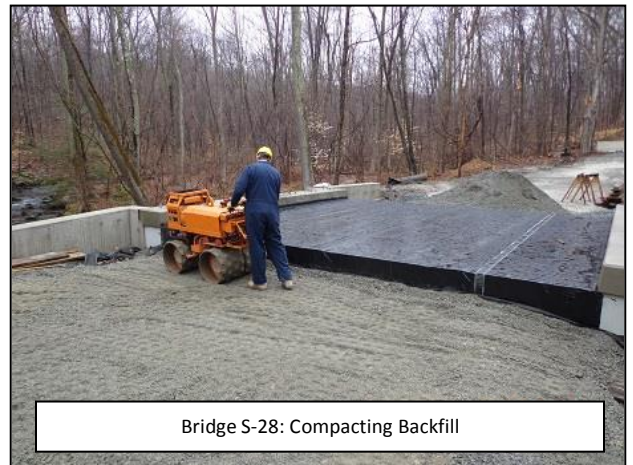
Bridge S-28: Compacting Backfill