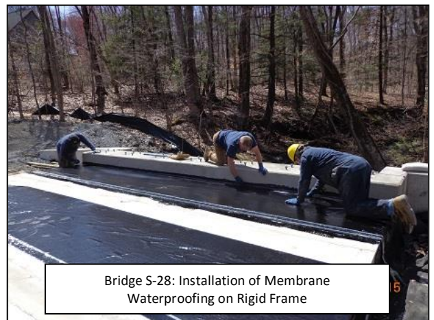
Bridge S-28: Installation of Membrane Waterproofing on Rigid Frame