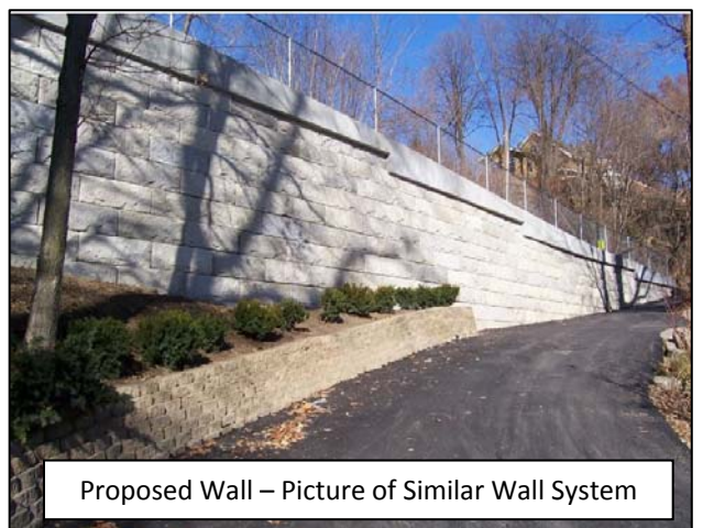
Proposed Wall – Picture of Similar Wall System