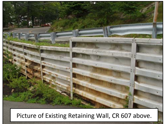
Picture of Existing Retaining Wall, CR 607 above.