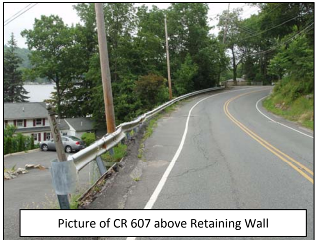
Picture of CR 607 above Retaining Wall