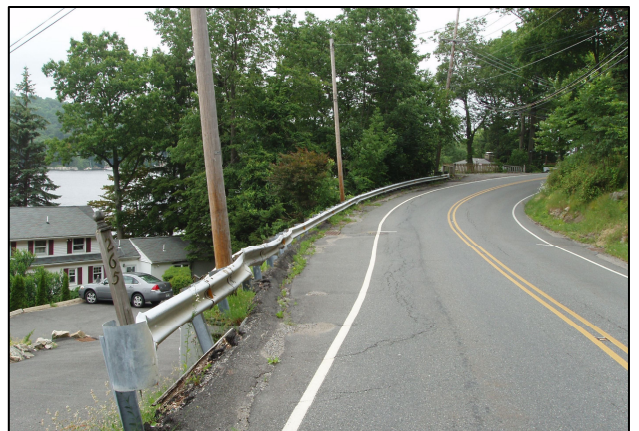
Picture of CR 607 above Retaining Wall