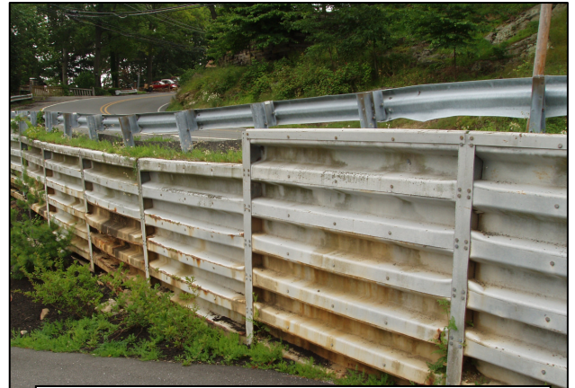
Picture of Existing Retaining Wall, CR 607 above.