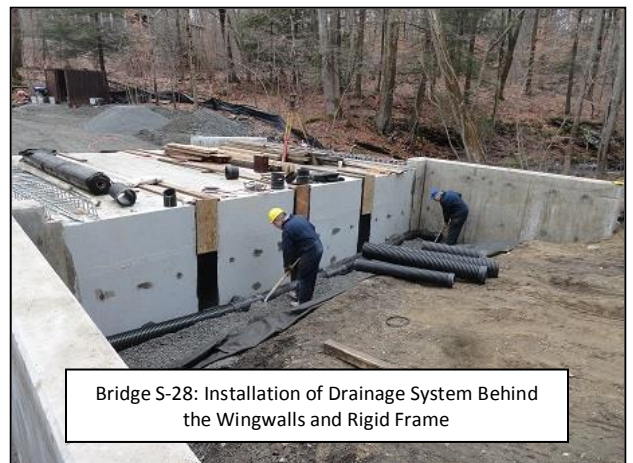
Bridge S-28: Installation of Drainage System Behind the Wingwalls and Rigid Frame