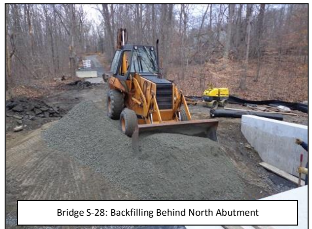
Bridge S-28: Backfilling Behind North Abutment