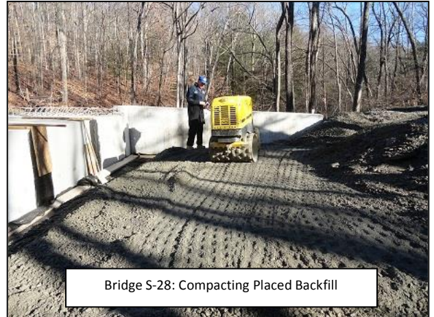
Bridge S-28: Compacting Placed Backfill