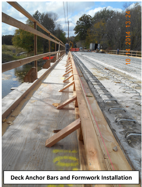
Deck Anchor Bars and Formwork Installation

Future updates of the project schedule will be provided as dates and durations are confirmed.