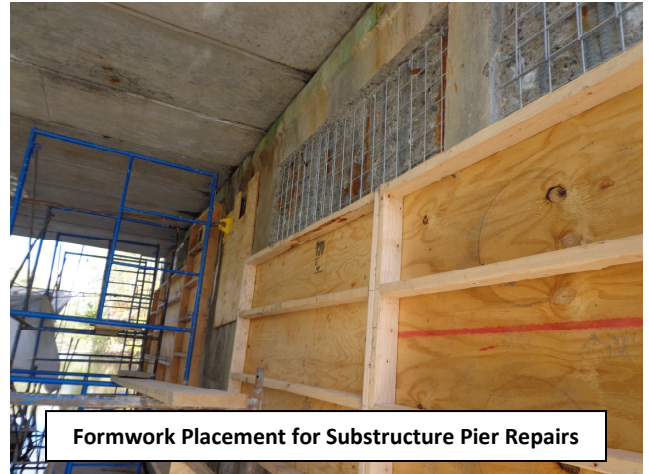
Formwork Placement for Substructure Pier Repairs