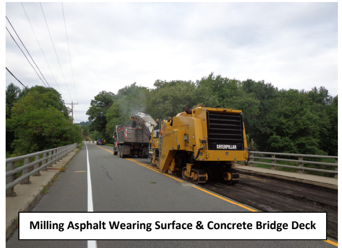
Milling Asphalt Wearing Surface & Concrete Bridge Deck