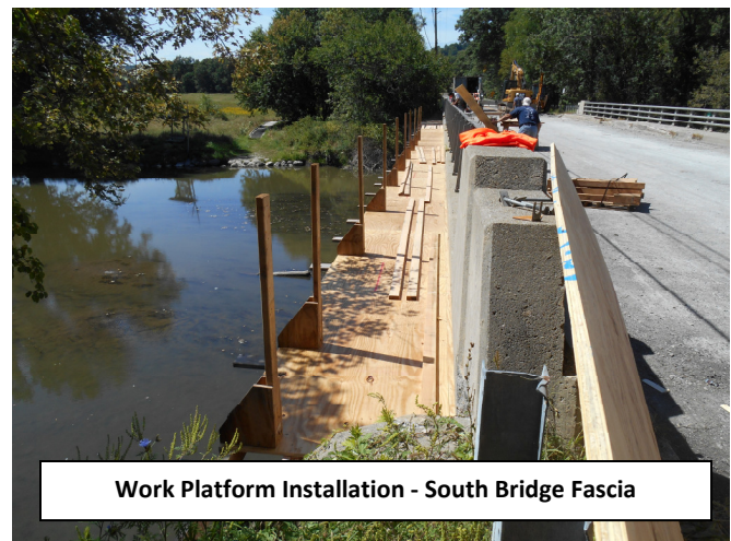
Work Platform Installation - South Bridge Fascia