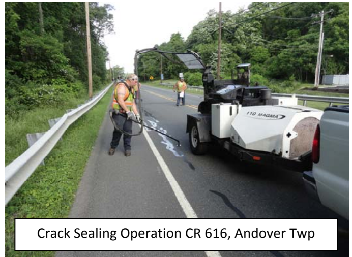
Crack Sealing Operation CR 616, Andover Twp