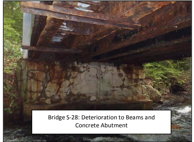
Bridge S-28: Deterioration to Beams and Concrete Abutment