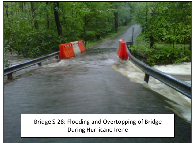
Bridge S-28: Flooding and Overtopping of Bridge During Hurricane Irene