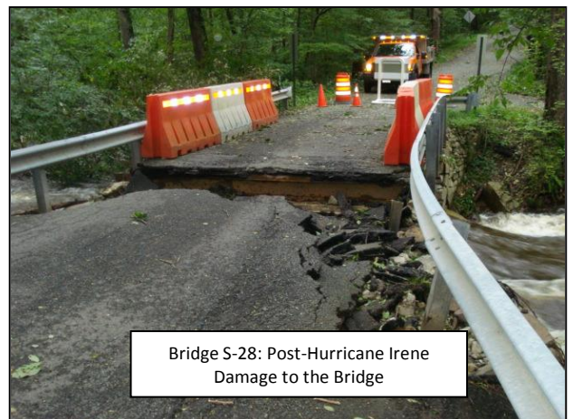
Bridge S-28: Post-Hurricane Irene Damage to the Bridge