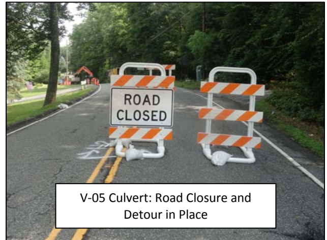
V-05 Culvert: Road Closure and Detour in Place