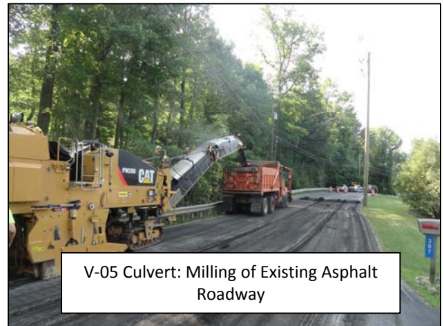
V-05 Culvert: Milling of Existing Asphalt Roadway