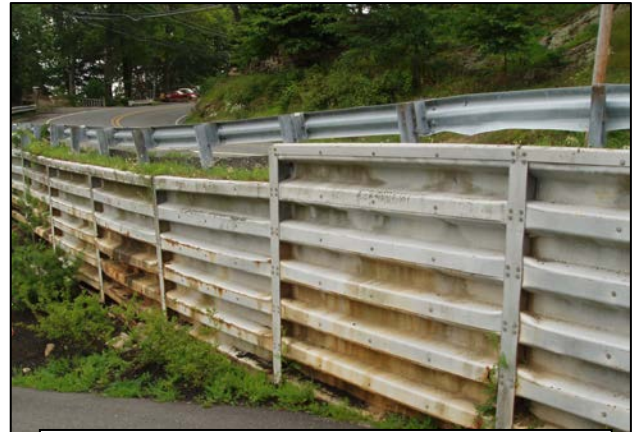
Picture of Existing Retaining Wall, CR 607 above.