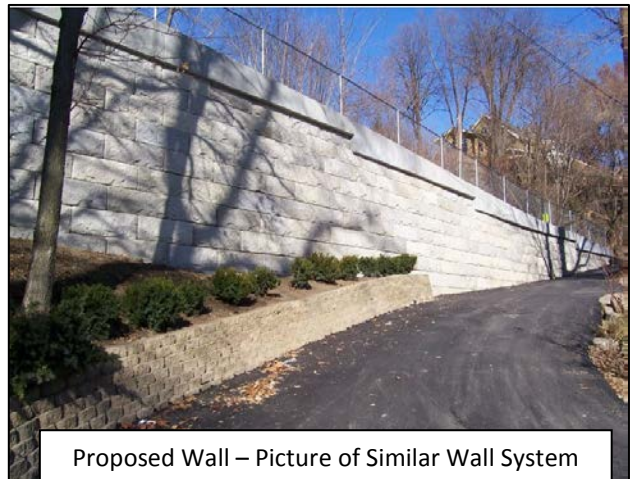
Proposed Wall – Picture of Similar Wall System