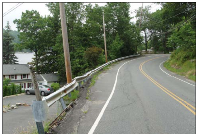
Picture of CR 607 above Retaining Wall