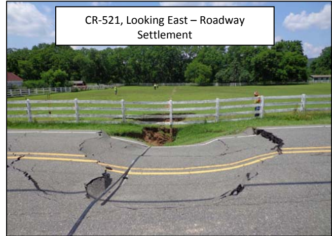
CR-521, Looking East – Roadway Settlement

For more information about this project please feel free to contact the Sussex County Division of Engineering at 973-579-0430 or dpw@sussex.nj.us .