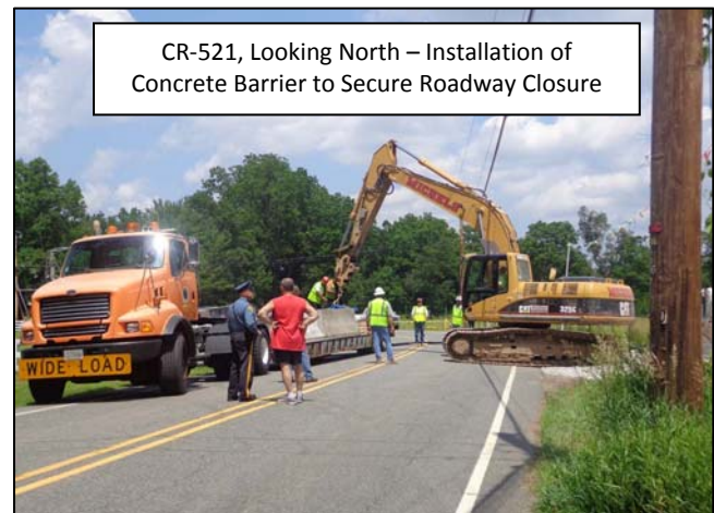
CR-521, Looking North – Installation of Concrete Barrier to Secure Roadway Closure