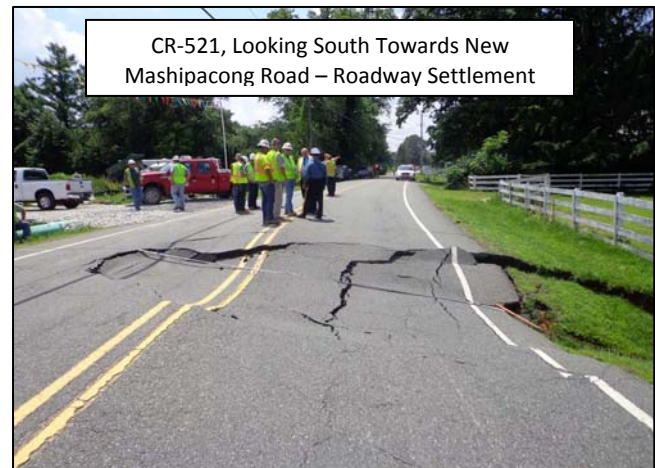
CR-521, Looking South Towards New Mashipacong Road – Roadway Settlement