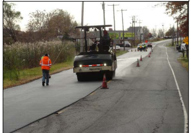
Asphalt Compaction – CR 639 Loomis Avenue