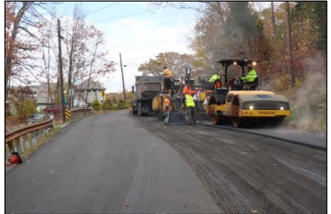
Asphalt Paving – CR 620 Glen Road