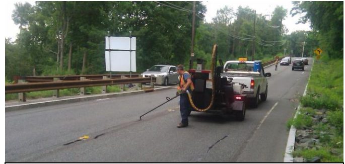
Typical Cracksealing Operation