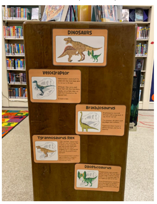
Dinosaur Scavenger Hunt at Dennis Branch Library in Newton