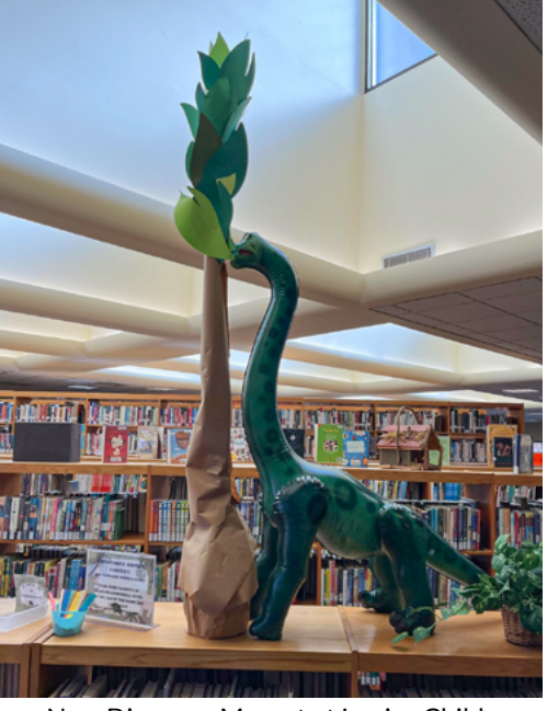
New Dinosaur Mascot at Louise Childs Branch Library in Stanhope

For further information on Dinovember and other upcoming events, visit the SCLS website at sussexcountylibrary.org/events or contact a local library branch. Programs and events are free of charge and open to the public.