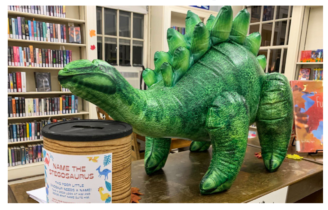
Name our dinosaur display at Dennis Branch Library in Newton