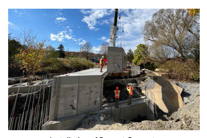
Installation of Precast Concrete Rigid Frame (Bridge) Segments