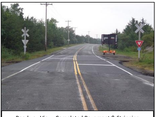
Roadway View: Completed Pavement & Stripping