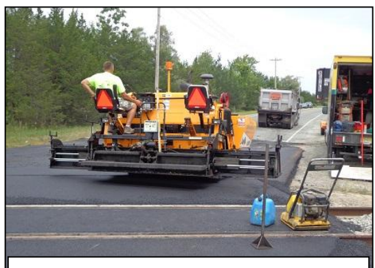
Roadway View: Paving of Top Course