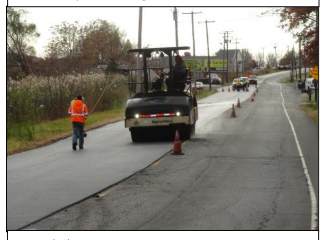
Asphalt Compaction – CR 639 Loomis Avenue