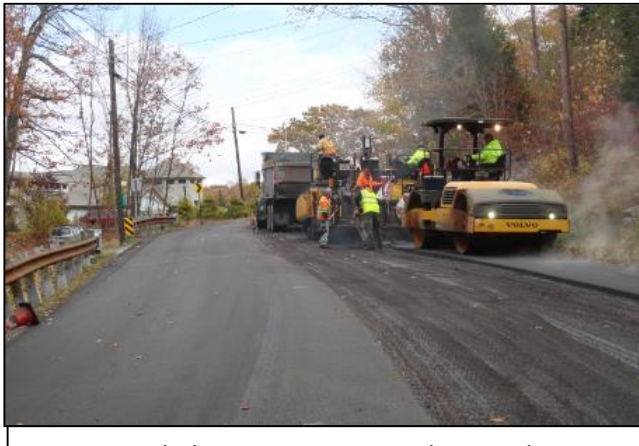
Asphalt Paving - CR 620 Glen Road