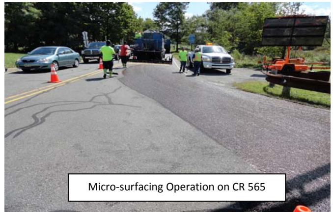
Micro-surfacing Operation on CR 565

These projects will include Micro-surfacing application which will increase the roadway surface friction thereby enhancing a vehicles ability to "hold" the road, i.e. the road will not be as slippery. Also, new signage and roadside delineation will be installed in conformance with current standards.