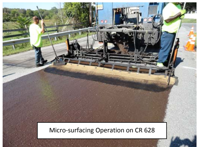
Micro-surfacing Operation on CR 628