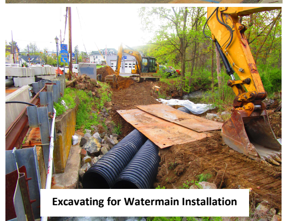
Excavating for Watermain Installation