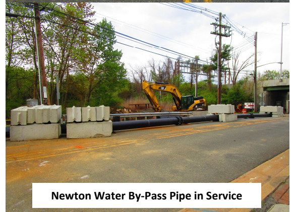
Newton Water By-Pass Pipe in Service