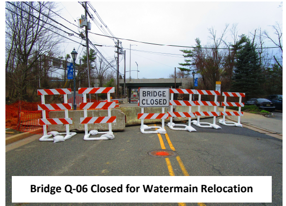
Bridge Q-06 Closed for Watermain Relocation