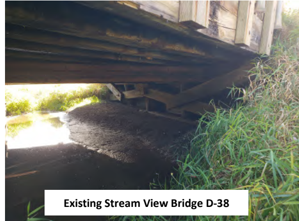
Existing Stream View Bridge D-38

Carrying CR 519 (Wantage Avenue) over Dry Brook Tributary in Frankford Township is an 18’ timber multi-stringer bridge founded on timber piles. Bridge D-38 has been deemed functionally obsolete due to the substandard bridge roadway width and is posted with “Narrow Bridge” warning signs. Recent consultant inspection also noted a poor condition rating for the superstructure and substructure. The project involves the design of a full replacement structure incorporating current design standards.