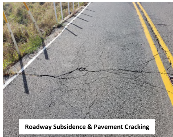
Roadway Subsidence & Pavement Cracking

A road closure and signed detour will be in place for the duration of construction. Access to driveways and municipal roads will be maintained throughout construction.