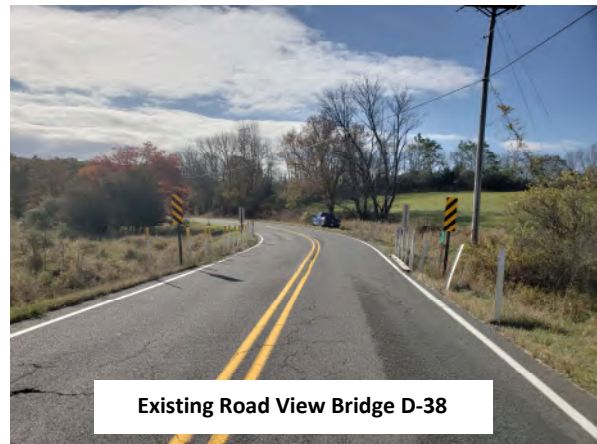
Existing Road View Bridge D-38