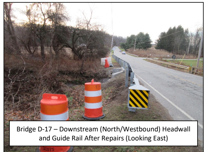
Bridge D-17 – Downstream (North/Westbound) Headwall and Guide Rail After Repairs (Looking East)