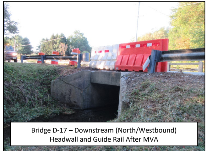
Bridge D-17 – Downstream (North/Westbound) Headwall and Guide Rail After MVA