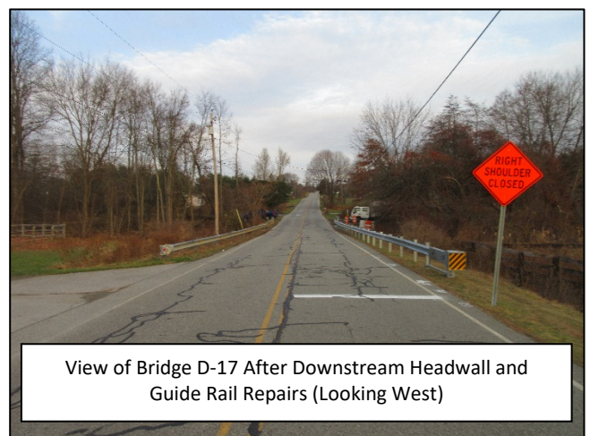
View of Bridge D-17 After Downstream Headwall and Guide Rail Repairs (Looking West)