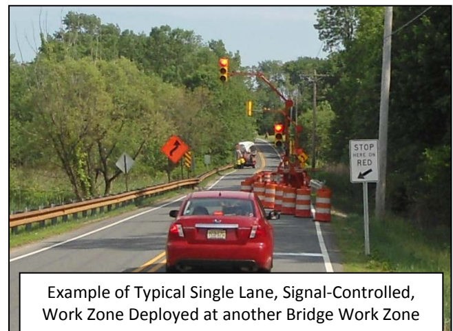
Example of Typical Single Lane, Signal-Controlled, Work Zone Deployed at another Bridge Work Zone