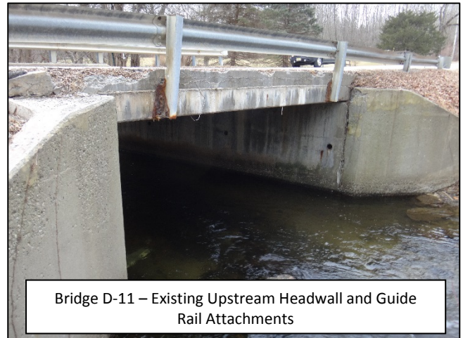
Bridge D-11 – Existing Upstream Headwall and Guide Rail Attachments