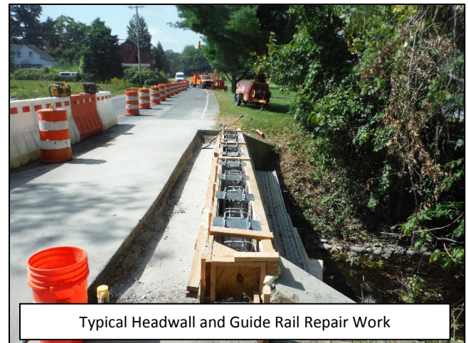
Typical Headwall and Guide Rail Repair Work