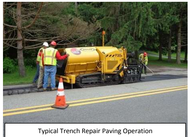
Typical Trench Repair Paving Operation