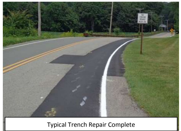
Typical Trench Repair Complete