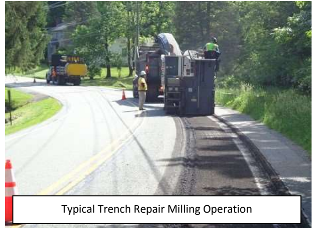
Typical Trench Repair Milling Operation