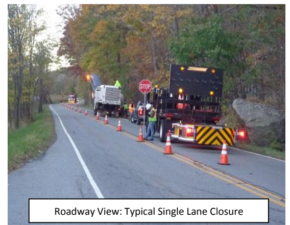
Roadway View: Typical Single Lane Closure