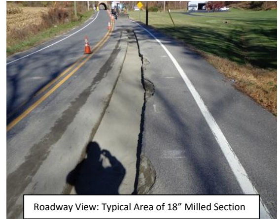
Roadway View: Typical Area of 18” Milled Section