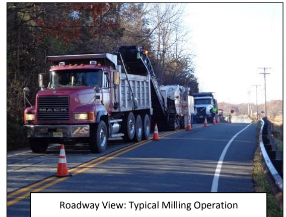
Roadway View: Typical Milling Operation