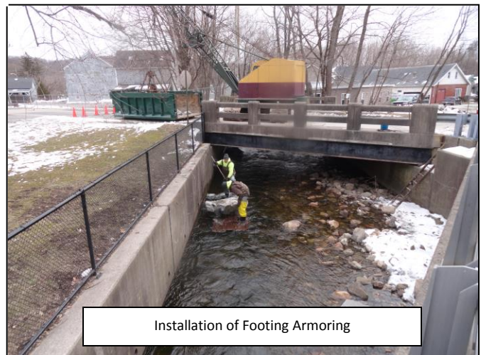
Installation of Footing Armoring