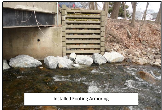
Installed Footing Armoring