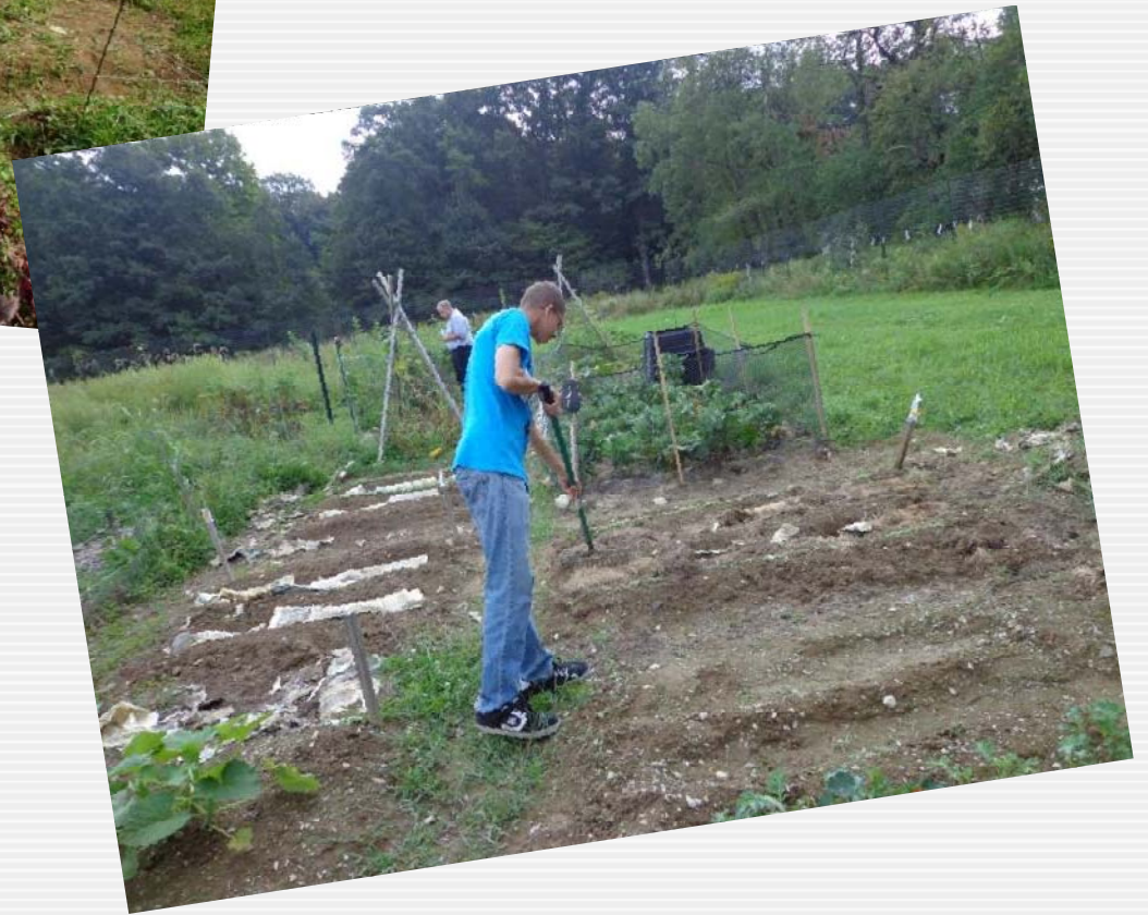
Community service at the Andover Charity Garden