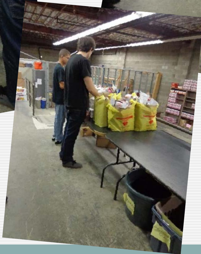
Community service at the food pantry